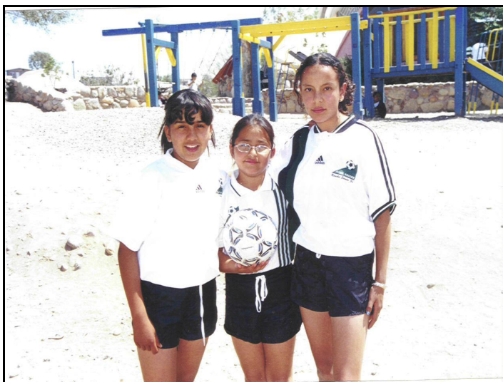
Members of Colegio La Esperanza Girls Soccer Team 2002