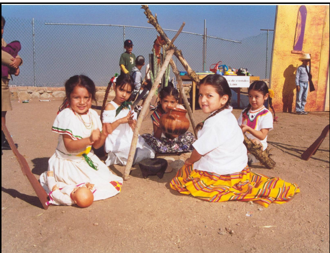
Kindergartners recreate campfire during Gran Kermesse Presentation November 2002